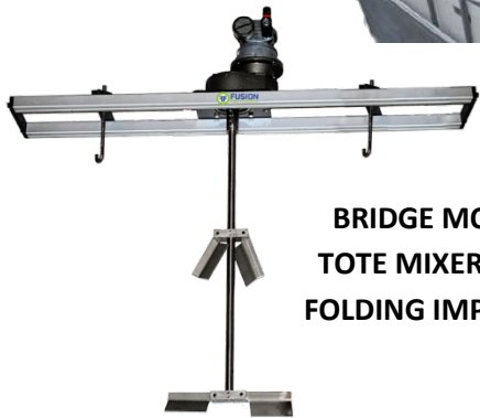
BRIDGE MOUNT TOTE MIXER WITH FOLDING IMPELLERS