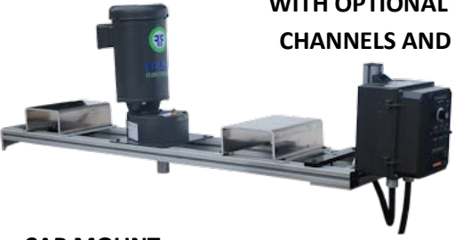
BRIDGE MOUNT TOTE MIXER WITH OPTIONAL FORK CHANNELS AND VFD

Most Tote Mixers SHIP NEXT BUSINESS DAY When ordered by 1:30pm EST