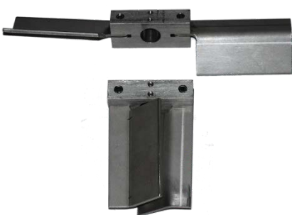
TOTE STYLE FOLDING IMPELLERS DESIGNED FOR LIMITED-ACCESS VESSELS